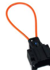
Fig. 01 F.O. loop connector